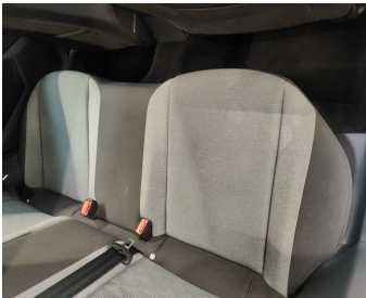
Interior Cleaning // Small-stain