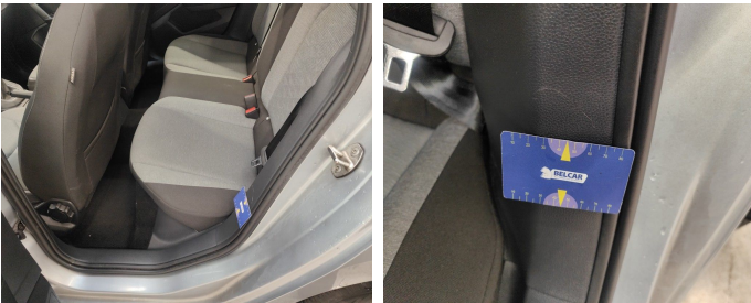
Interior / Side Cover rear Seat / Replace-scratch