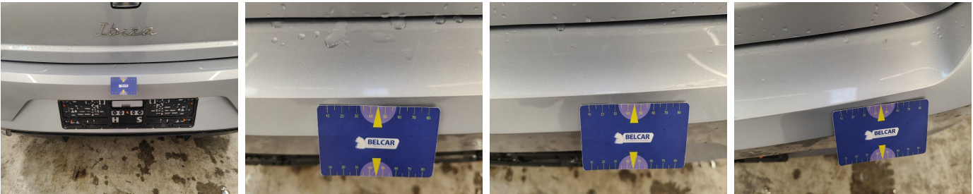
Bumper Rear // Polish-scratch