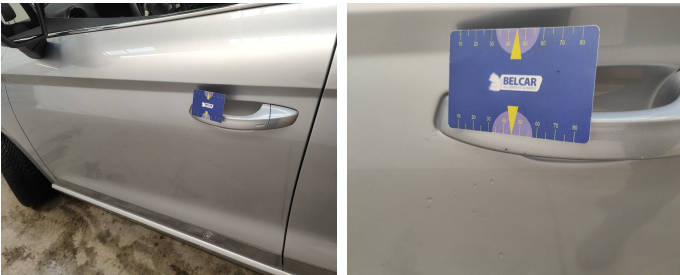
Door Front Left // Smart Repair Medium-scratch