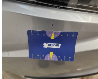
Bumper Front // Painting-scratch