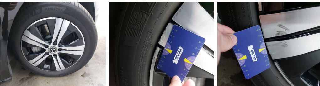
Wheel Two Tone Front Right // Repair-scratch