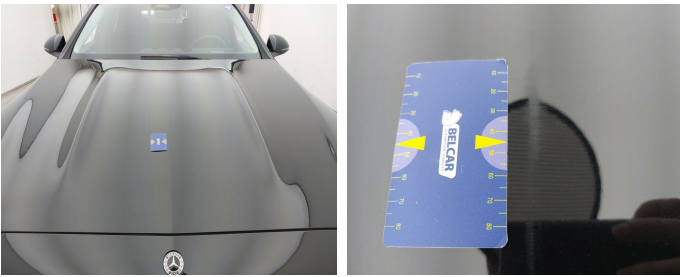
Front Bonnet // Polish-scratch