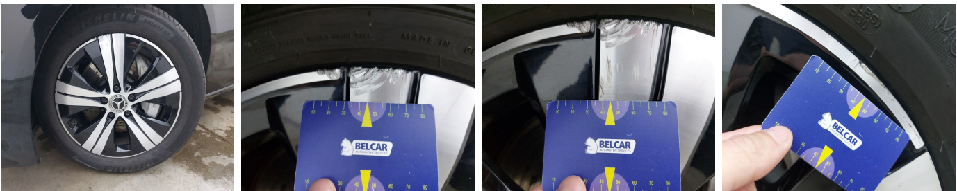
Wheel Two Tone Front Left // Repair-scratch