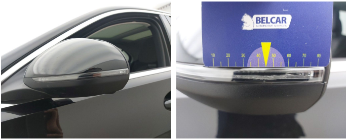
Side View Mirror Left / Direction Indicator / Replace-scratch