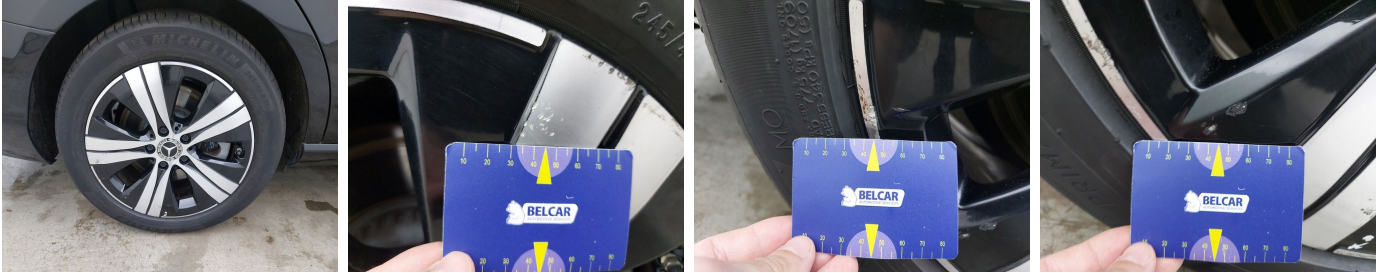
Wheel Two Tone Rear Right // Repair-scratch