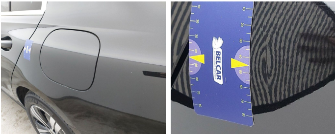
Wing Rear Left // Smart Repair Small-dent