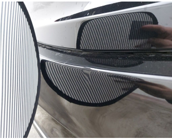
Bumper Rear // Repair & Painting-scratch + dent