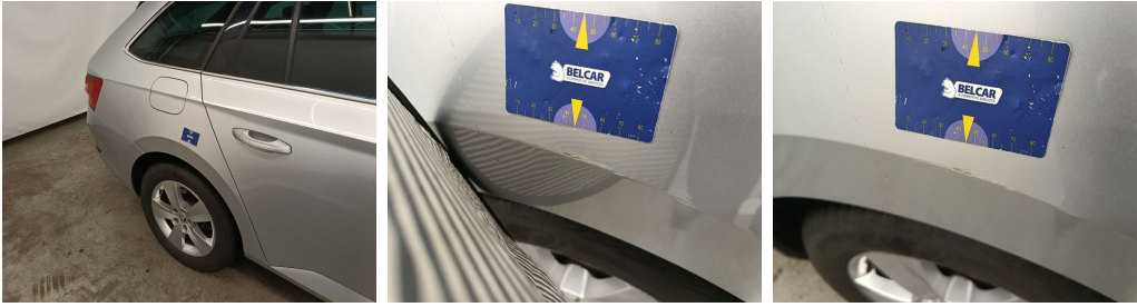
Wing Rear Right // Repair & Painting-scratch + dent