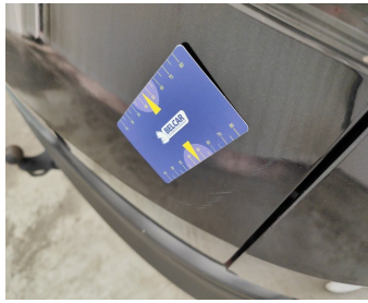
Rear Bonnet // Polish-scratch