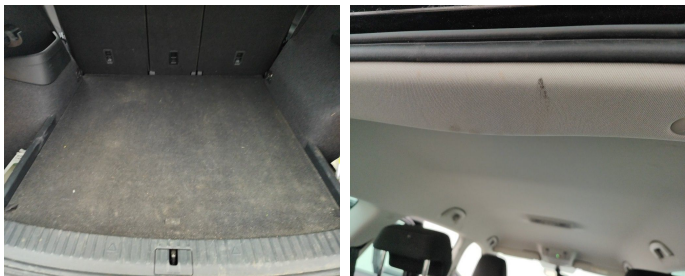
Interior Cleaning // Small-stain