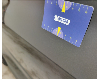
Door Rear Right // Repair & Painting-scratch + dent