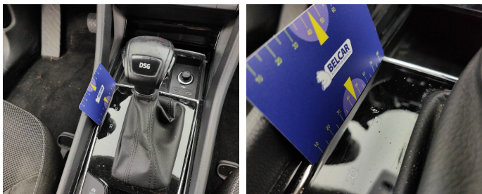
Central Console // Repair-Incinerated