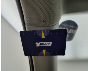
Interior // Repair 2-Incinerated