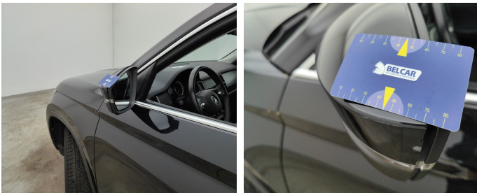
Side View Mirror Left // Painting-scratch