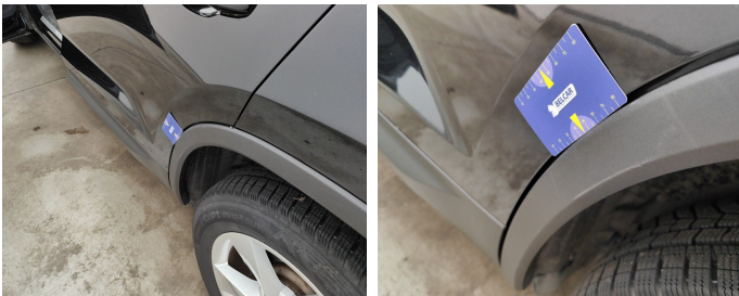
Wing Rear Left / Trim / Replace-scratch