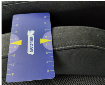
Interior // Repair 1-Incinerated