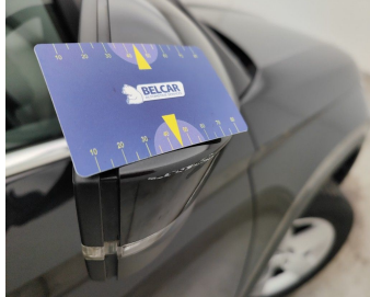
Side View Mirror Right // Painting-scratch