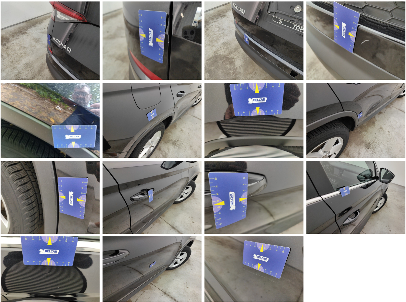
Damage within Renta-norm-