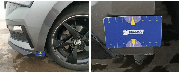
Bumper Front // Smart Repair Large-scratch