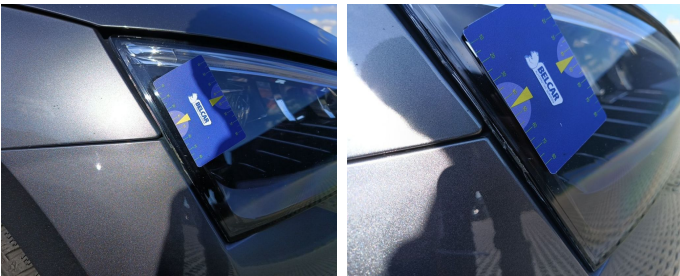
Headlight LED / Front left / Replace-scratch