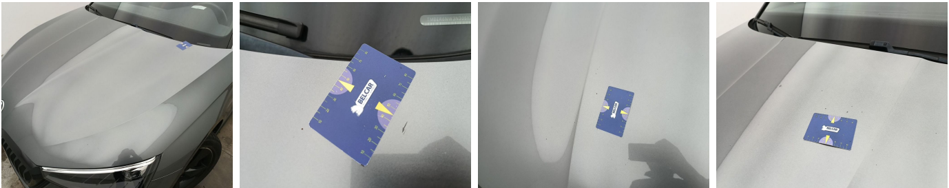
Front Bonnet // Painting-stone chipping