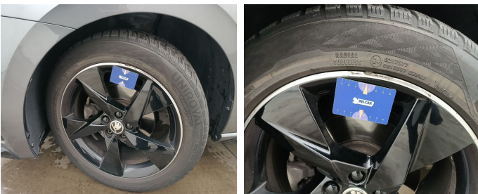
Wheel Two Tone Front Left // Repair-scratch