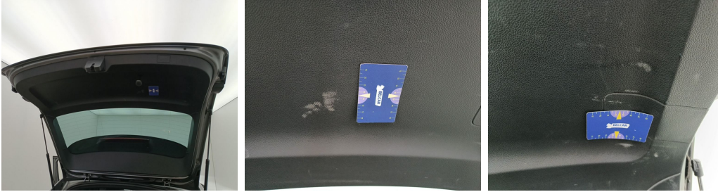
Trunk Lid Interior Coating / Complete Panel / Replace-scratch