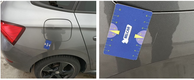
Wing Rear Right // Painting-scratch