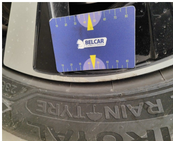
Wheel Two Tone Rear Left // Repair-scratch