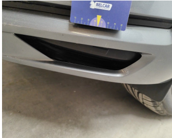
Bumper Front / Grid Left / Replace-bad position