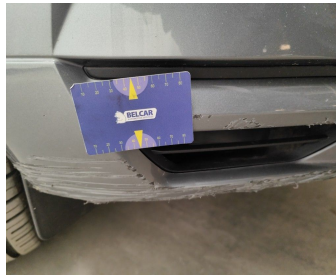
Bumper Front // Repair & Painting-scratch + dent