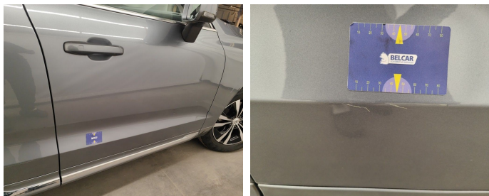
Door Front Right // Painting-scratch