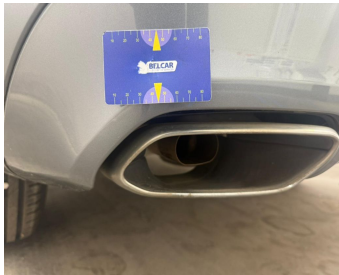
Bumper Rear / Trim Left / Replace-bad position