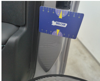
Door Front Right // Repair & Painting-scratch + dent