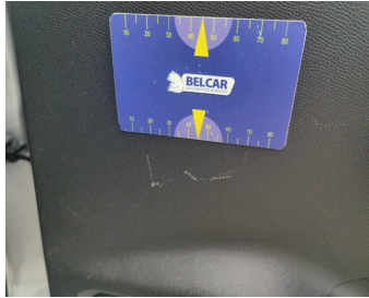
Rear Right Door Interior Coating // Repair-scratch