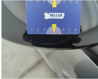
Side View Mirror Right // Painting-scratch