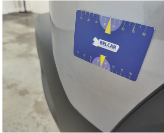
Bumper Rear // Polish-scratch