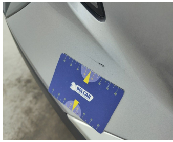
Bumper Front // Painting-scratch