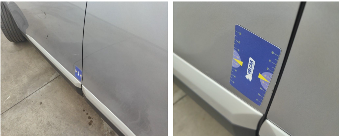
Door Front Left // Smart Repair Small-scratch