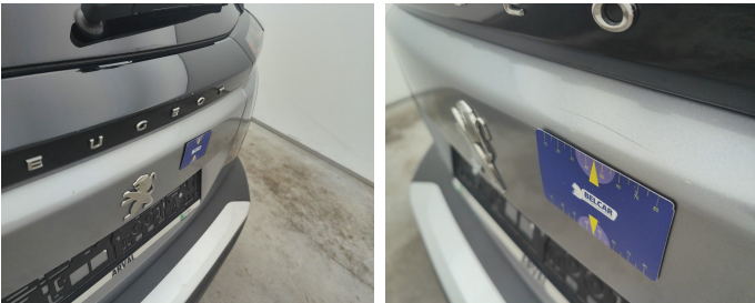
Rear Bonnet // Painting-scratch