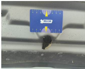
Front Bonnet / Insulation / Replace-missing