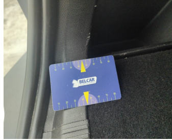
Trunk Compartment / Side Cover Left / Replace-scratch