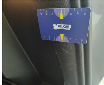
Trunk Compartment / Side Cover Right / Replace-scratch