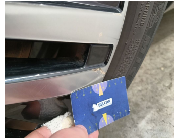
Wheel Two Tone Rear Right // Repair-scratch