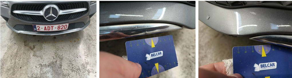
Bumper Front / Spoiler / Replace-cracked