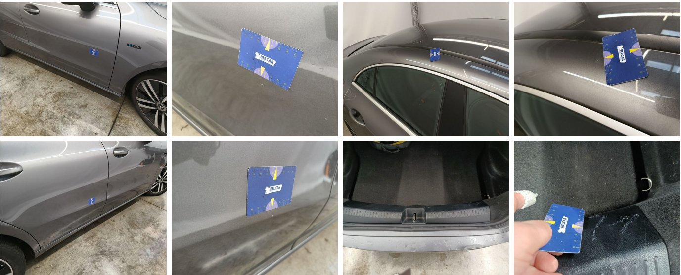
Damage within Renta-norm-scratch