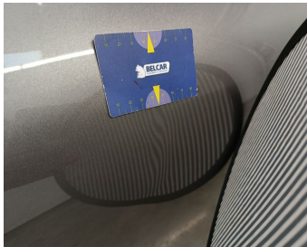
Door Rear Left // Smart Repair Small-dent