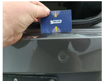
Bumper Rear // Replace & Painting-scratch + dent