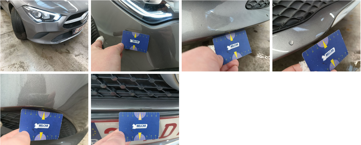
Bumper Front // Repair & Painting-scratch + dent