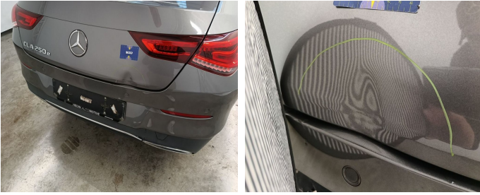
Rear Bonnet // Repair & Painting-dent