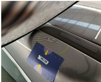
Roof // Smart Repair Medium-dent