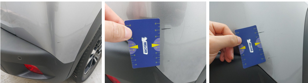
Bumper Rear // Smart Repair Medium-scratch