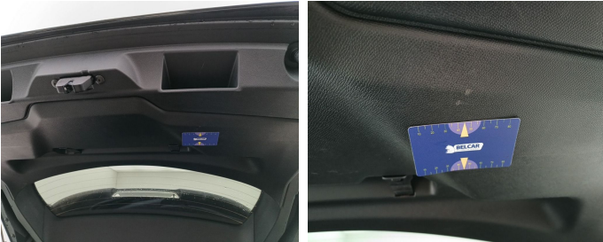
Trunk Lid Interior Coating / Complete Panel / Replace-scratch