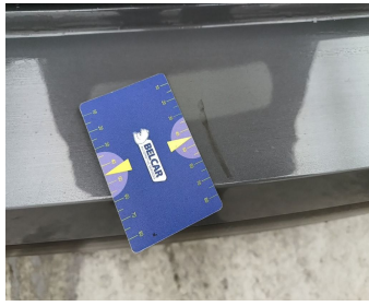
Bumper Rear // Polish-scratch