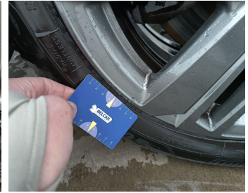
Wheel Alloy Front Left // Repair-scratch