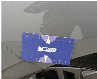
Wing Front Left // Painting-stone chipping