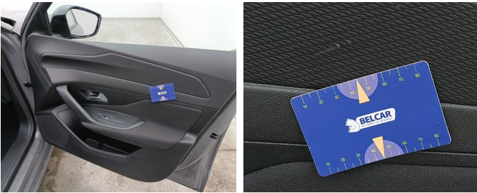
Front Right Door Interior Coating // Repair-scratch