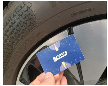
Wheel Two Tone Rear Left // Repair-scratch