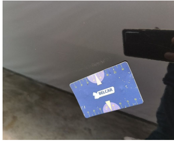
Door Rear Left // Polish-scratch