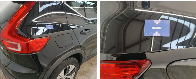
Wing Rear Right // Polish-scratch