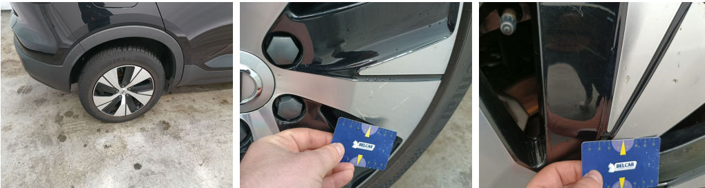
Wheel Two Tone Rear Right // Repair-scratch