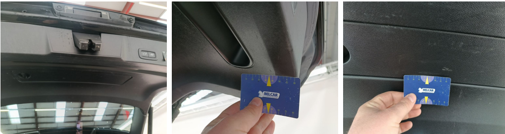
Trunk Lid Interior Coating / Complete Panel / Replace-scratch