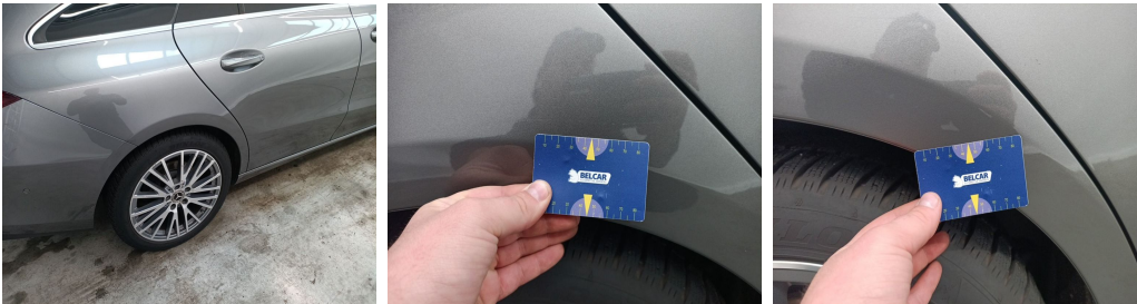
Wing Rear Right // Polish-scratch