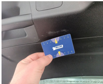
Trunk Lid Interior Coating / Complete Panel / Replace-scratch