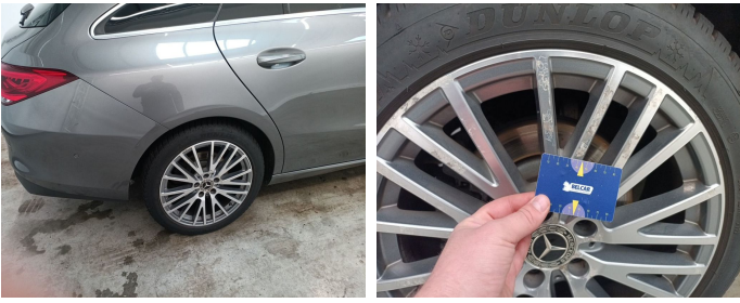
Wheel Two Tone Rear Right // Repair-Chemical reaction