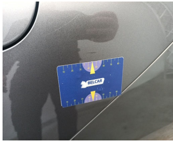
Wing Rear Left // Painting-scratch