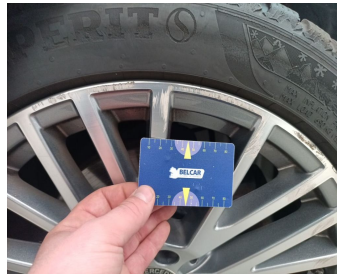
Wheel Two Tone Front Right // Repair-scratch