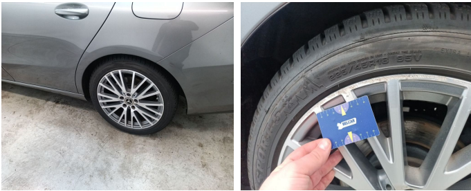
Wheel Two Tone Rear Left // Repair-scratch