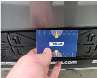
Bumper Rear // Painting-scratch