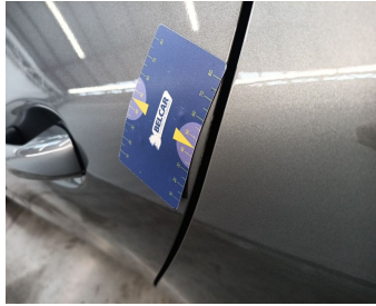
Door Rear Left // Smart Repair Small-scratch