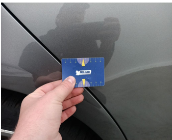
Door Rear Right // Polish-scratch