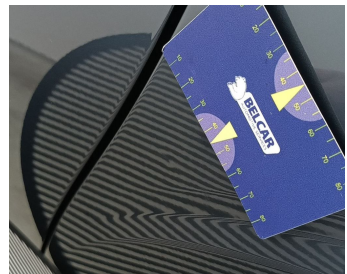
Wing Rear Left // Repair & Painting-scratch + dent