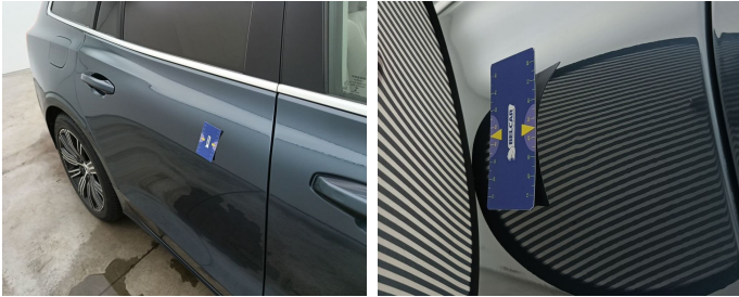
Door Rear Right // Smart Repair Small-dent