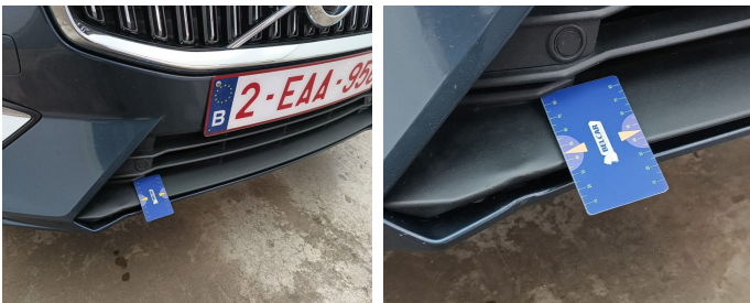
Bumper Front / Grid Central / Replace-scratch + dent