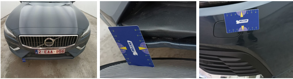
Bumper Front // Repair & Painting-scratch + dent