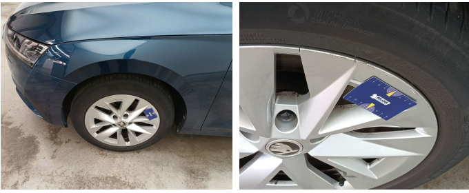
Wheel Alloy Front Left // Repair-scratch