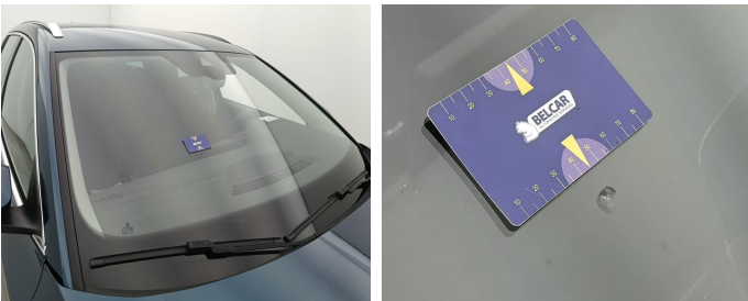
Windshield // Repair-glass damage