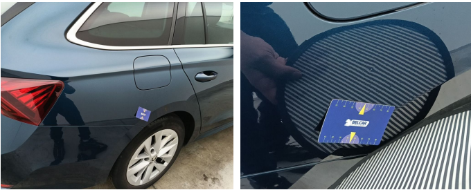
Wing Rear Right // Smart Repair Small-scratch + dent