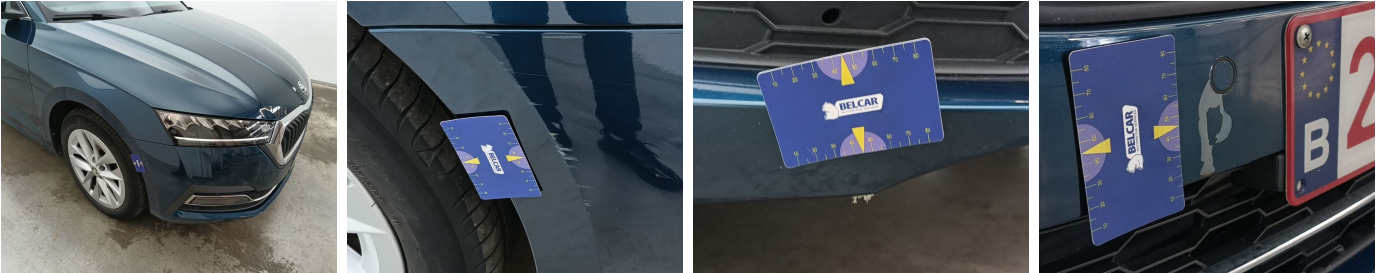
Bumper Front // Painting-scratch