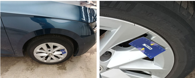
Wheel Alloy Front Right // Repair-scratch