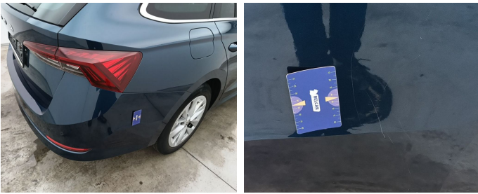
Bumper Rear // Polish-scratch