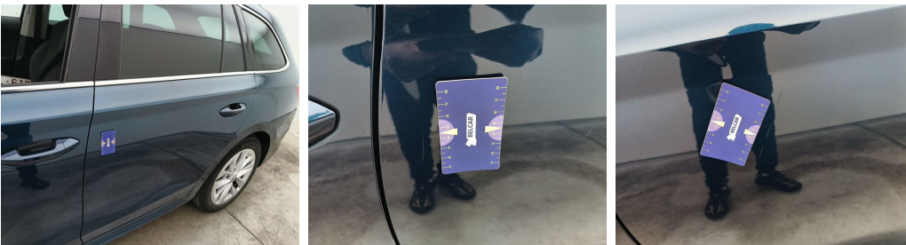
Door Rear Left // Polish-scratch